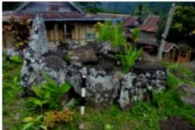
Figure 4. Altar of Umpungeng

Results of local manuscript or chronicle search by Mr. Dr. Muhlis Hadrawi regarding the area and megalith structure of Umpungeng shows that Umpungeng is a wanua (village) that has an important position as the center of rites (ceremonies) within the scope of the Kingdom of Soppeng, not in terms of politics, power, economy, and troop strength. As the center of the rite (ceremony), Umpungeng is thought to be the earlier wanua appeared and is the area of origin of the surrounding settlements. Therefore, Umpungeng is referred to as the country of origin by the ancestors who made the mountain village around Bulu Dua. It is only natural that then Umpungeng becomes a ritual center recognized by the surrounding villages.