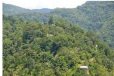
Figure 1. Mountain topography of Umpungeng Site with houses far apart

The distance of the Umpungeng megalith from the capital Watansoppeng is about 35 km. Road access to Umpungeng Village can only be passed by motorbikes and horses. The types of vegetation found in Umpungeng Village are clove trees, banana trees, pine trees, palm trees, coconut trees and coffee trees. At the foot of a row of hills, flow several rivers