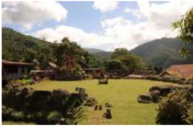
Figure 2. The Umpungeng megalith

People refer to the stone-gathering bracelet as Barugae , a round shape that sometimes revolves around several parts. There are three, in the south, east, and west. (Figure 2). Ladder on the east side is a ladder used to go up to barugae and the stairs on the west side are stairs down or places out after a ritual ceremony. Batu temu bracelet is located on the ridge, which serves as a place of worship, inauguration and deliberation. There are 56 chunks of stone that make up the arrangement of the bracelet, also serving as a seat when the ritual takes place. The dimensions of the arrangement of the bracelet are long 17.50 meters and 15 meters wide. 20 meters.